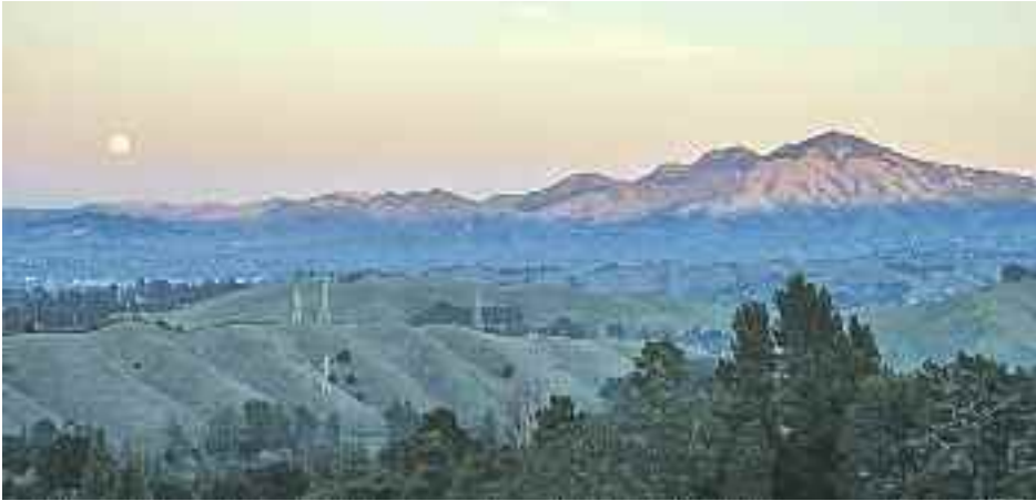
"Moonrise over Mt. Diablo"